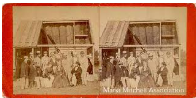
Early years of Vassar College

Maria became professor of astronomy at Vassar College in 1865 and was named Director of the observatory there. Maria soon realized that she was paid much less as a woman professor. She demande d that the college pay her just as much as the men professors. Guess what? After asking for more money, she eventually received the same pay as the men professors.