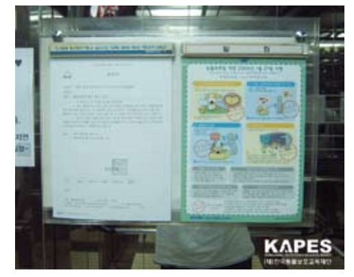
Another Animal Welfare Call Center poster designed and distributed by KAPES.

Many Seoul district offices have helped distribute the pamphlet, including Gwanak-gu and Jungrang-gu. However, the most proactive local government has been Sungnam City – home to the largest dog meat market, Moran Market. For more information about new developments in Sungnam City's dog meat market, please see the article below.