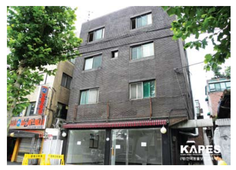
The site of KAPES new Education and Adoption Center.

s a way to achieve its dual mission of animal-related advocacy and service, IAKA/KAPES has long dreamed of establishing an animal rights education and adoption center in Seoul. In 2006, IAKA/KAPES saw the first ray of hope for this dream project, when the International Fund for Animal Welfare (www.IFAW.org) awarded us a generous, one-time grant to help with the purchase of a building to house the center. After more than 15 years of partnering with IAKA on animal protection advocacy in Korea, IFAW saw this as an ideal way to pass the torch of advocacy in Korea to IAKA/KAPES. The $500,000 grant represented IFAW's faith in IAKA's readiness to take the lead through a groundbreaking center for animal rights education, pet adoption, and animal care.