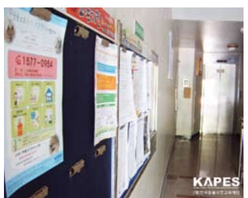
A poster advertising the new Animal Welfare Call Center at a district office.

n May 2010, the Ministry of Agriculture opened a badly needed Animal Welfare Call Center devoted to connecting pet owners and animal lovers with a host of animal protection, adoption, and care resources. The center puts callers in touch with representatives, district officials, shelters, and hospitals, who can provide information regarding animal abuse, animal rescue, animal health and care, lost pets, and animal protection law. The call center can be reached from anywhere in Korea by dialing 1577-0954.