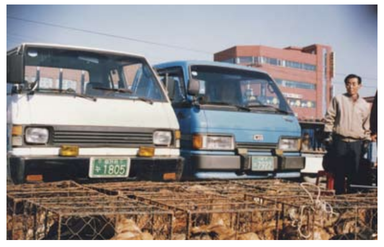
Caged dogs at Sungnam's notorious Moran Market.

But soon abuses like these will come to an end. As part of a new city plan to be completed by 2014, the temporary market is going to be shut down, and new market buildings and an apartment complex will be developed. Though the new development includes an indoor shopping complex, city officials have deemed that the dog meat trade will not be allowed in the new facilities. This is good news for animal